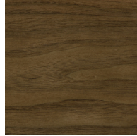
Walnut Natural - WAL